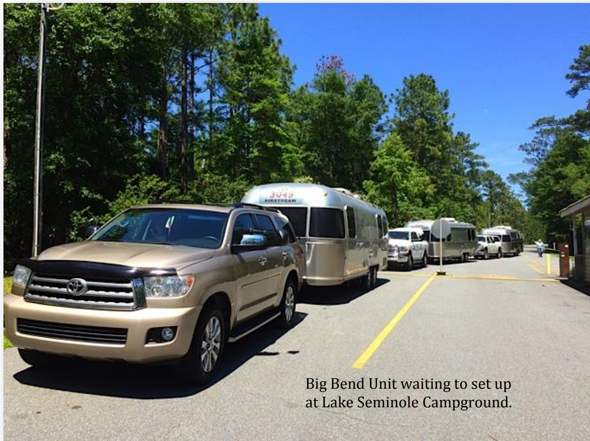
Big Bend Unit waiting to set up at Lake Seminole Campground.

Hope everyone will stay healthy. Let's go camping.