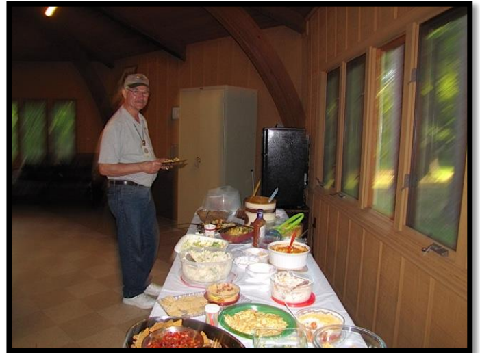
What a spread!