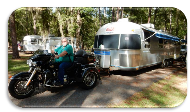
Hmmmm....Chips new tow vehicle????