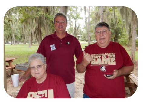
So are the FSU fans!