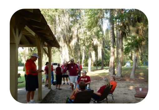
Beautiful setting and weather.