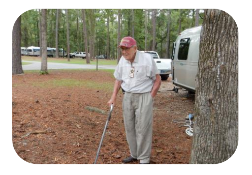
Step 3. Assign a supervisor.