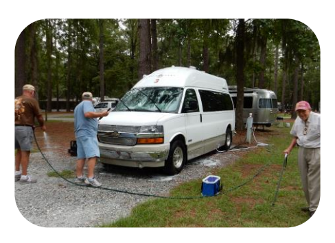
Step 2. Start to scrub off the love bugs.