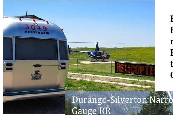
Bill & Linda Helicopter ride at Badlands & train ride in Colorado