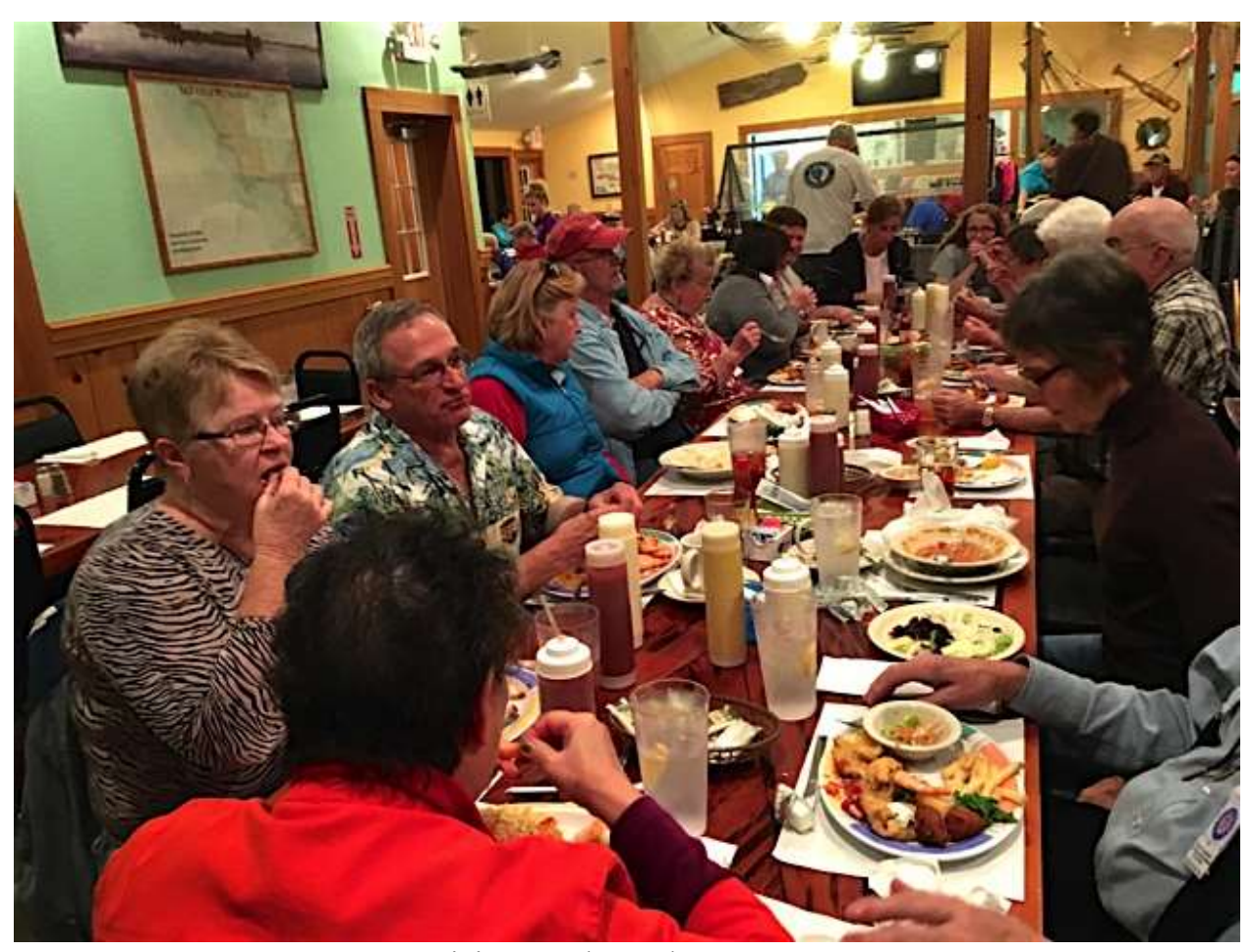
Dining at Salt Creek Restaurant

Rally Report: Yellow Jacket RV Resort continued . . .