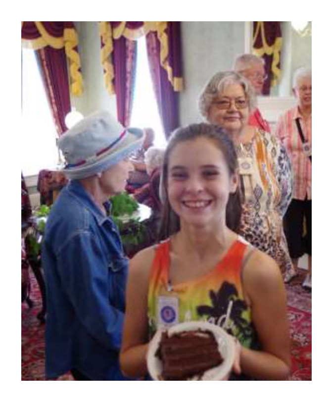
eat dessert first."