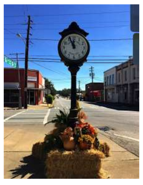
Harvest clock in Colquitt

Lyrics from The Storytelling Song performed at Swamp Gravy