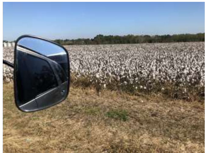
Cotton fields ready for harvesting

My rally experience started a few hours before I arrived at the park. I found a restaurant in Cordele, GA that was #1 on Trip Advisor. It was called Tri-County Seafood Market and Restaurant. Their special of the day was mullet and roe. I have been craving this since it is the season for mullet roe. They did not disappoint and it sure was good! After that, I was on to the park.