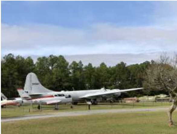
Aircraft on display in the park

Some stayed behind and watched college football. We gathered at 3:00 p.m. back at the pavilion for a white elephant/flea market/silent auction to honor the sacrifices of service members on Veteran's Day and to benefit K9 for Warriors, an organization that provides veterans with service dogs. There were lots of treasures and baked goods donated for the cause. We raised $236.00! Thanks to everyone that participated in this endeavor.