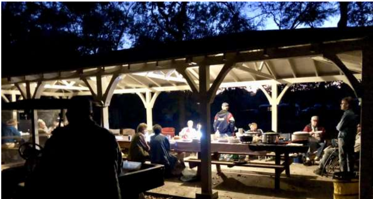
Friday night pot luck dinner at the pavilion

The rally started off Friday evening with a pot luck dinner. It was a good time under the pavilion. Thanks to the members that brought lanterns. Evening now comes early and we needed them!