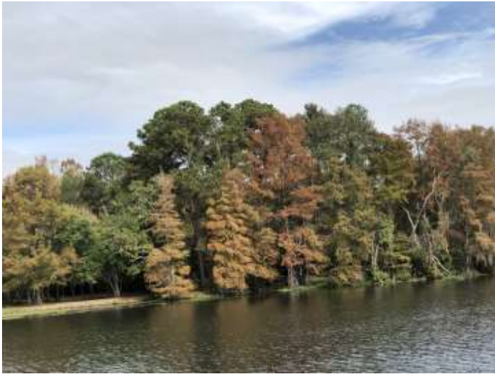
Changing colors on Lake Blackshear

Fall was definitely surrounding us this weekend. Leaves were turning colors and the weather was cool - finally! Heading up to Georgia Veteran's State Park in South Georgia was serene. The farmers' crops were being gathered. Tractors and wagons were all over the road taking in cotton and peanuts. It really reminded me of the true American Farmer and what they stand for. It also reminded me of the harvest of the crops that led to the Thanksgiving holiday that we now celebrate!