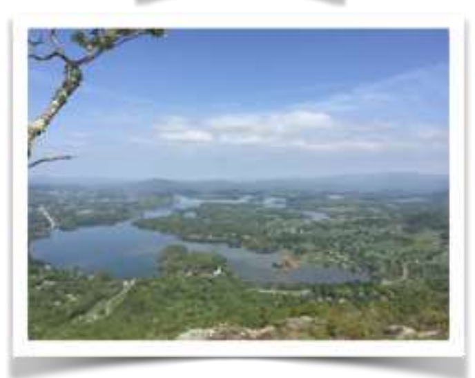
View from top of Bell Mountain