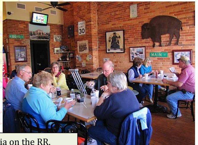
Trip to Plains Georgia on the RR. Rally attendees at Georgia Veterans SP