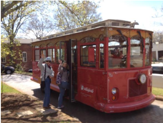
Trolley ride in Milledgeville, Ga