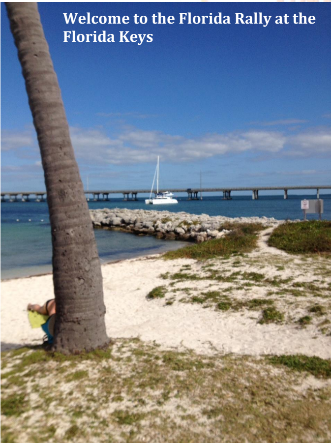
Welcome to the Florida Rally at the Florida Keys