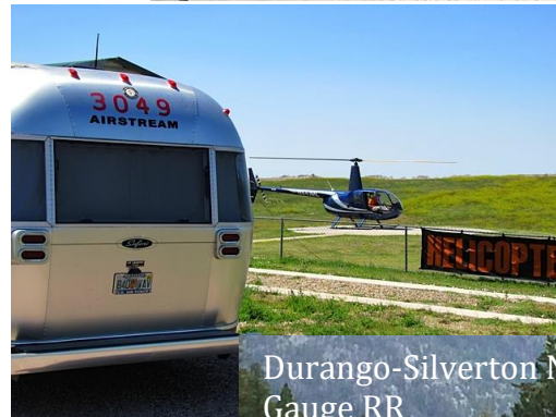
Durango-Silverton Narrow Gauge RR